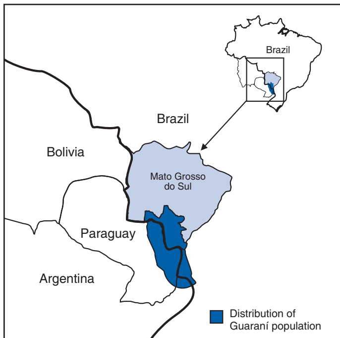
FIGURE 1. Geographic distribution of Guaraní population — Mato Grosso do Sul, Brazil, Argentina, and Paraguay

Participants in the study were from the Kaiowá and Nandeva communities of the Guaraní population, collectively referred to as Guaraní in this report. FUNASA medical teams determined cause of death using categories from the International Classification of Diseases and Related Health Problems, Tenth Revision (ICD-10) (3). Suicide was defined as a death resulting from purposely self-inflicted poisoning or injury corresponding to ICD-10 codes X60–X84 and Y87. Demographic data on Guaraní were drawn from routinely updated census information such as name, sex, date of birth, ethnicity, address, village, Special Indigenous Sanitary District (DSEI), and municipality. As part of an ongoing ethnographic study, an anthropologist obtained qualitative information on each death through interviews with persons who included political and spiritual leaders of the communities. Participants were asked questions about the decedent (e.g., observations of decedent's behavior) and the community (e.g., social or environmental conditions that might have been associated with the suicide). Among the Guaraní in 2000, information on age was available for all but seven cases of suicide, and information on sex was available for all but one case. Demographic data for deaths in other years were complete. Crude rates and age- and sex-specific rates were calculated per 100,000 population.