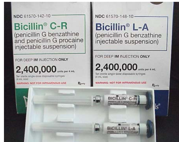
FIGURE. Labeling of Bicillin® C-R and Bicillin® L-A products before changes implemented in 2004