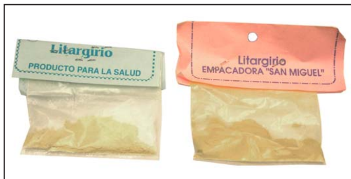
FIGURE. Packages of litargirio, a yellow or peach-colored powder, used as an antiperspirant/deodorant and a folk remedy in the Hispanic community