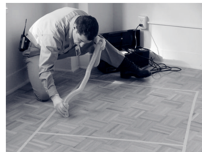
FIGURE. U.S. Public Health Service commissioned officer collecting samples from a previously cleaned interior residential area — New York City, November 2001