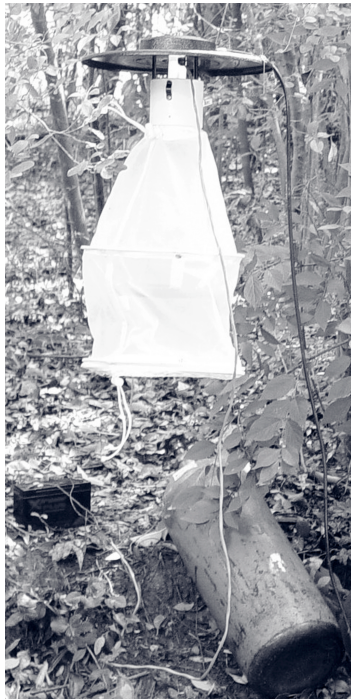
FIGURE. CDC light trap used during investigation to capture Anopheles sp. mosquitoes