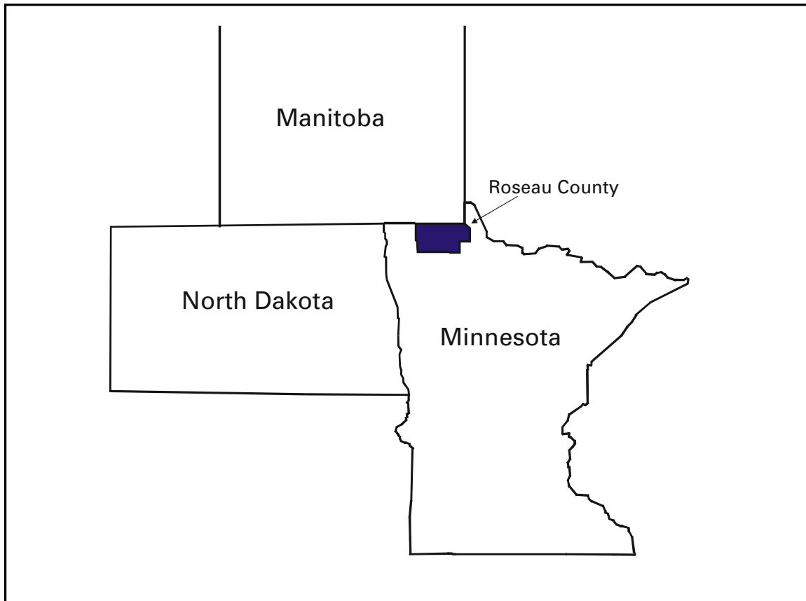
FIGURE 1. Location where Bacillus anthracis has been isolated from steer carcasses — Roseau County, Minnesota, North Dakota, and Manitoba, Canada, 2000

possible interventions range from close observation to antibiotics alone to antibiotics with vaccination, because the family was at high risk for anthrax infection, management consisted of an extended course of ciprofloxacin combined with administration of anthrax vaccine.