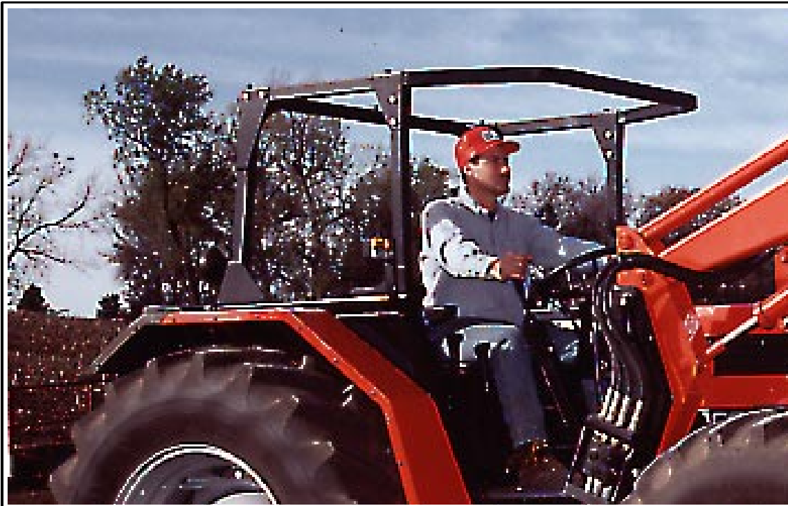
FIGURE 1. Rollover protective structure on a farm tractor

employers to provide ROPS and seatbelts for all employee-operated tractors † manufactured after October 25, 1976 (2). Although virtually all tractors sold after 1985 have been equipped with ROPS, farms with <11 employees are not subject to OSHA inspection or enforcement, and farms managed by family members with no other employees are not required to comply with OSHA standards; in Kentucky, 94% of the farms are family-owned businesses with <11 employees (5). The median age of tractors investigated in this report was 23 years. One fatal tractor rollover in this study involved a 1979 tractor manufactured without ROPS. Because it was purchased for use on a family farm without employees, it was not subject to the ROPS standard. The cost to retrofit tractors manufactured before 1975 ranges from $400 to $1800, and economic constraints associated with farms in Kentucky limit the feasibility of appropriately modifying all tractors.