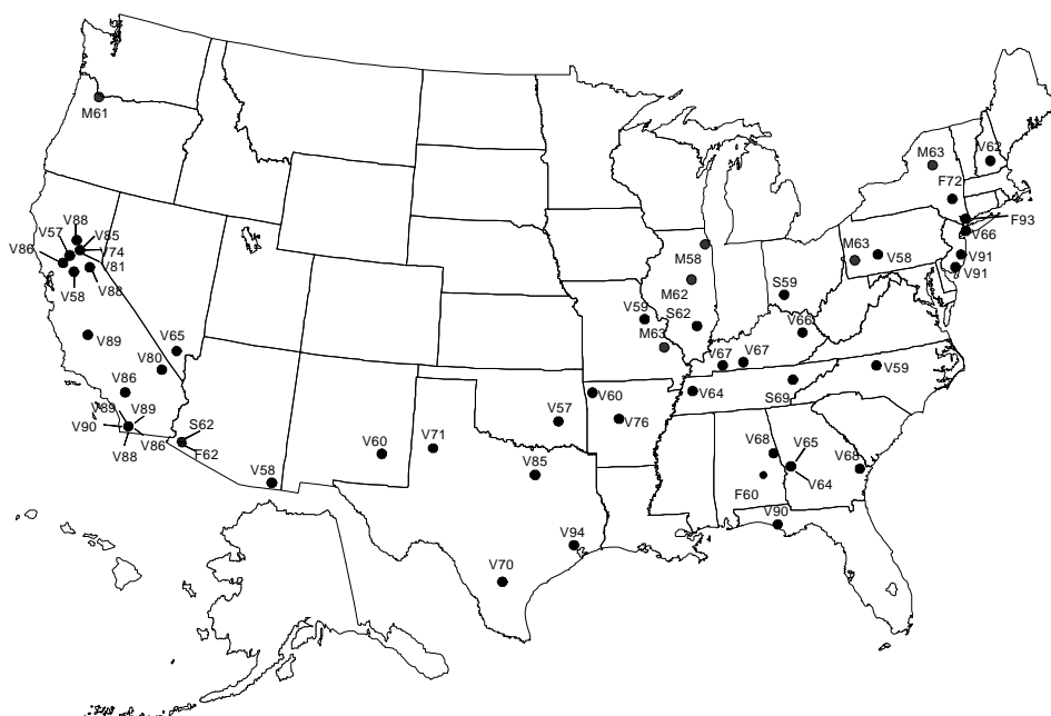
Figure 3. Location of presumed mosquito-borne malaria cases reported from 1957-1994. Each point denotes the location of the episode, the species identified (V = Plasmodium vivax , F = P. falciparum , M = P. malariae and S = P. sp. ), and year of occurrence.

In 1991, two separate episodes of locally acquired P. vivax malaria were identified, occurring more than 70 miles apart (3); the first was consistent with the expected epidemiologic pattern, but the second occurred in a suburban and densely populated area. The index case-patient was an 8-year-old boy, without risk factors for malaria, (travel or exposure to blood or blood products). Few undocumented agriculture workers were living in this suburban area, but a large number of documented immigrants and undocumented factory workers were identified. U.S. census data from 1990 indicated that the population of immigrants from the Indian subcontinent,